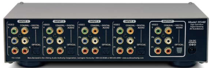
1154B rear panel